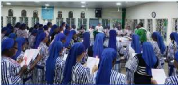
ANNUAL RECOMMITMENT OF PERPETUALLY PROFESSED SISTERS

We, had our annual Retreat, Sunday 31 st July, to Sunday 7th August, 2022 at the Center for Peace and Reconciliation (CEPAR), Atani Uromi, Edo State. It was a Directed Retreat with 72 Directees and 10 Directors of whom 3 were Priests and 7 religious women respectively. The Retreat was indeed one of its kind. Some of the Sisters testified to how grace filled and reviving it was for them while the directors commended the retreatants for their observance of silence and openness all through the retreat. The Perpetually Professed Sisters also had their recommitment at the end of the retreat. We are indeed grateful to God for the Sacred moments and aloneness with our divine spouse-Jesus. May the fruits, gifts and graces obtained during the retreat continue to abide with us all. Amen