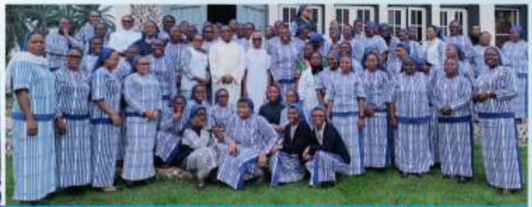
SISTERS WITH RETREAT DIRECTORS